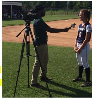
The Legion Lady Fastpitch League received awesome media coverage throughout the entire inaugural season!!!