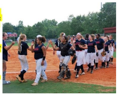
To conclude, the reason why we chose to pursue American Legion as a sanction for our league is to offer softball players the same opportunity as baseball players, to participate in one of the country's most traditional, respected and honored institutions. With the amount of exposure and interest that the league received in it's inaugural season we expect to see a lot of growth going forward. Our goal at this point is to move forward in our attempt to become officially sanctioned with American Legion.