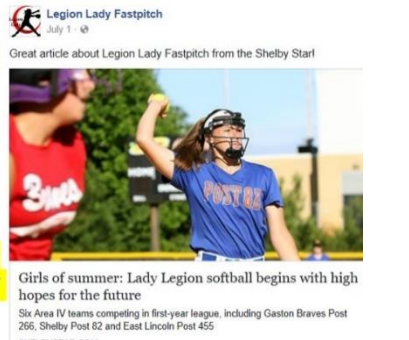
The Legion Lady Fastpitch League was covered by more than 15 newspapers in 11 Counties and 2 TV Stations!!!