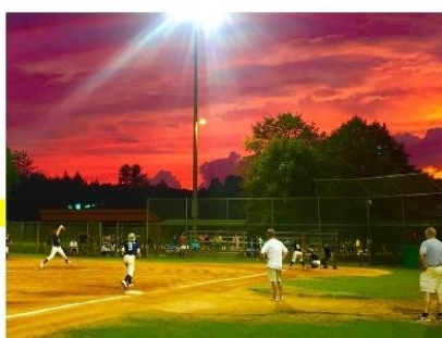
(Photo) Burke Post 21 delivers a pitch in a game against Lincoln County during a Legion Lady Fastpitch game in Morganton!!!

The Legion Lady Fastpitch League runs from mid May through July. The season operates on a regular season format followed by a State Tournament!