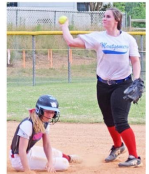
(Photo) A Montgomery County player makes a play over a sliding Cabarrus County runner in a Legion Lady Fastpitch game in Montgomery County!

The Legion Lady Fastpitch League has opened up a new opportunity for the competitive fastpitch softball player during the summer!