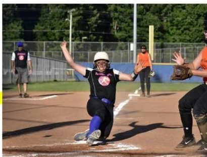
(Photo) A play at the plate at a Randolph vs. Stanly Legion Lady Fastpitch game!

The Legion Lady Fastpitch League specifically operates on weeknights, games are scheduled for Tuesday & Thursday nights as to not interfere with weekend ball.